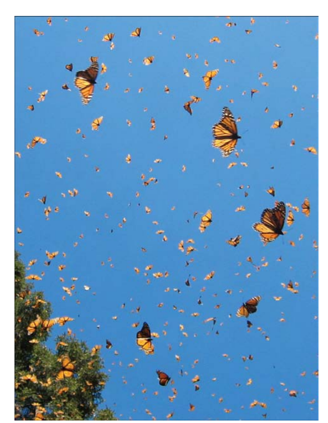
Overwintering monarchs fill the sky in Mexico.

Complete, up-to-date information about Monarch Watch's Monarch Waystation program is available online at: