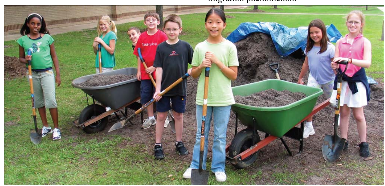
Breaking ground for Monarch Waystation #1015.

By creating and maintaining a Monarch Waystation you are contributing to monarch butterfly conservation. Your efforts will help ensure the preservation of the species and the continuation of the spectacular monarch migration phenomenon.